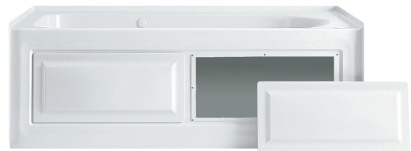
Skirted whirlpool models feature two (2) access panels.

*Reference technical data for pump locations